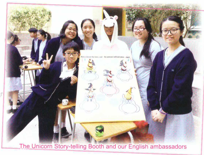
The Unicorn Story-telling Booth and our English ambassadors