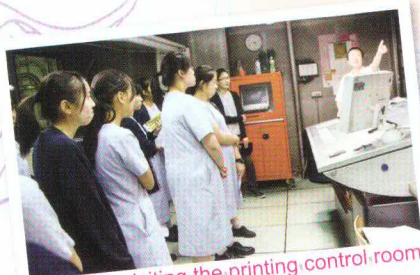
Students visiting the printing control room