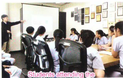
Students attending the news literacy workshop

very complicated process! He then showed us the machines that use the printing plates and the worker in charge of them explained to us how to operate them.