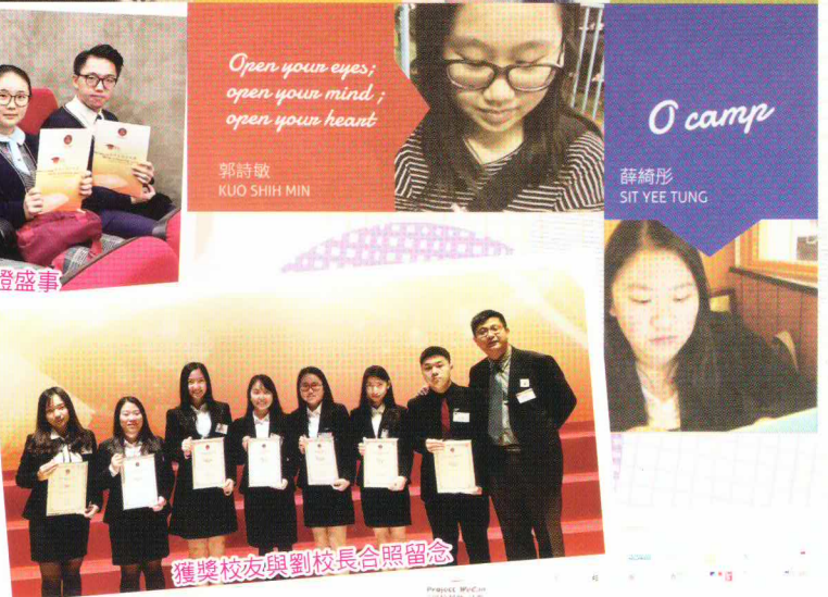
WeCan Scholarship WeCan Scholarship Presentation Ceremony 2017/18 2017/18「學校起動」計劃獎學金頒授典禮

正如主禮嘉賓楊潤雄局長所說：「每一個人都應該有學習的權利，升讀大學，不應該受經濟等因素影響他們的志向。」我相信只要有信心、有目標，我們距離入大學的路不會遠！