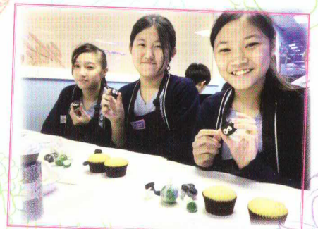
Students making the bat decorations for their Halloween cupcakes