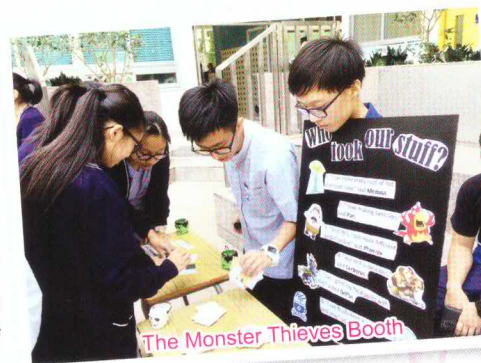
The Monster Thieves Booth

Everyone had a blast and they couldn't help but ask, “What's next from our incredible team of English teachers?”